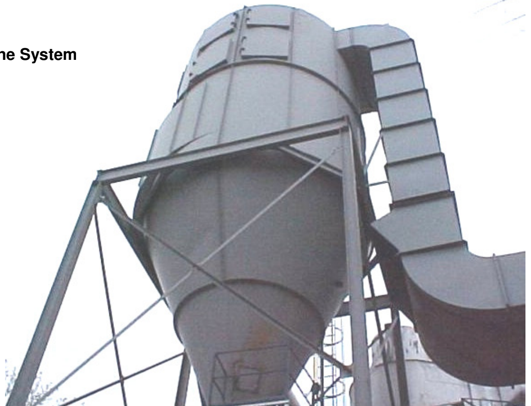
Outdoor Cyclone System