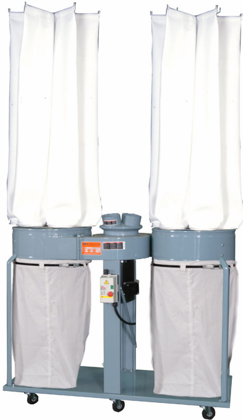
Portable Bag Type Collector

All types of dust collectors are considered acceptable as long as they have been researched, selected for the size of occupancy, designed for that use and installed in conformance with all applicable codes and standards for dust collection and also are approved by the Authority Having Jurisdiction.