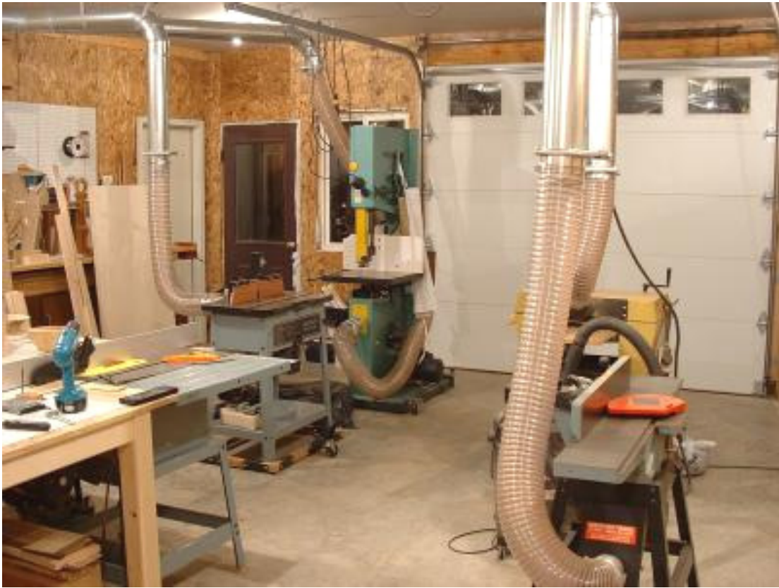
Metal Ductwork for Dust Collection System