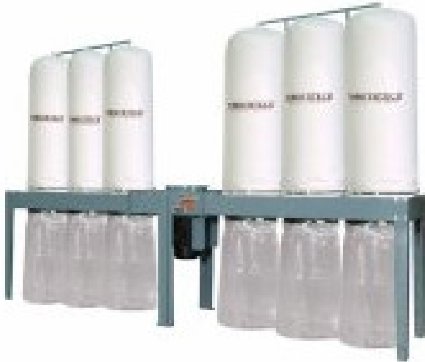
Multiple Bag Type Collector