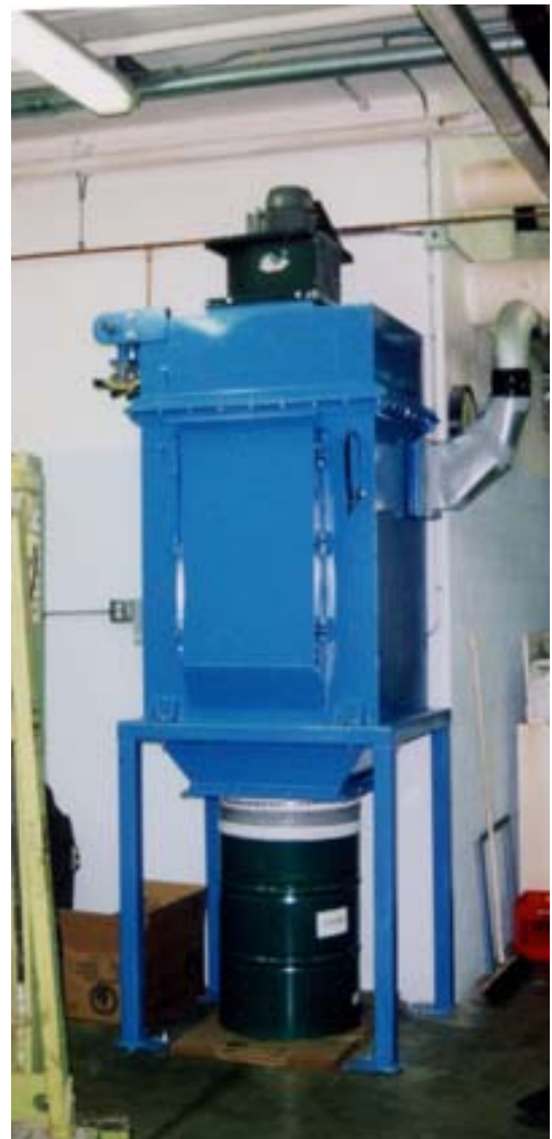
Compact Bag Filter System