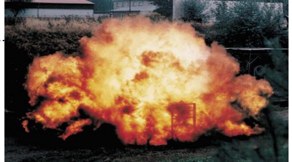
Typical Dust Explosion

Removing or controlling any one of these will greatly reduce the possibility of an explosion.