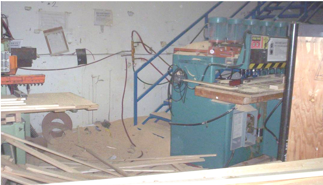
Examples of Poor Housekeeping